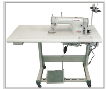
CM8700 mounted in optional stand